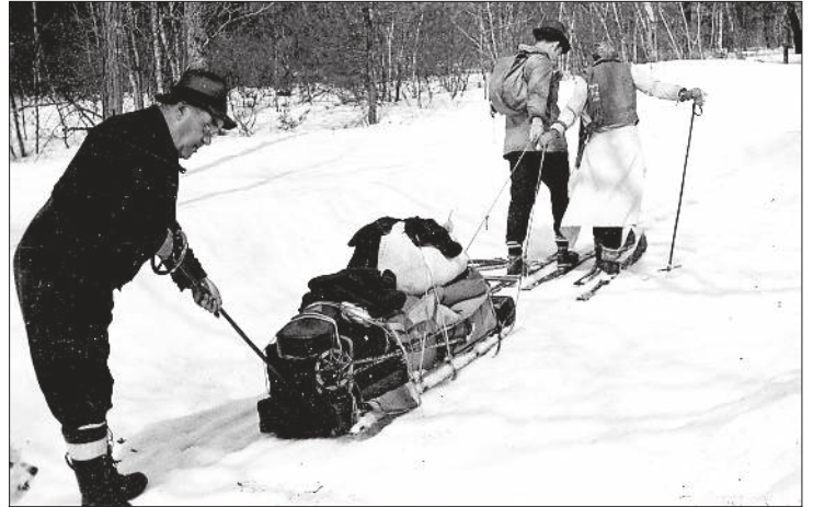
Food and supplies for a winter's stay being pulled in on a sledge. At least one hearty family celebrated Christmas at the lake this way—10 years in a row!

If you have old photos of Great East—summer or winter—that you'd like to contribute or if you have other historic material, stories or ideas that might be good for a future newsletter edition, please drop us a line at newsletter@greateastlake.org .