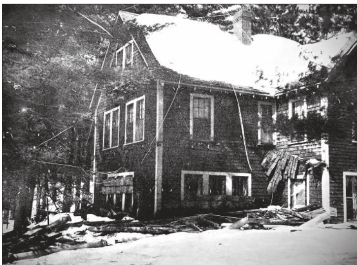
After two days of rain fell atop seven feet of accumulated winter snow in March 1969, camps everywhere on the lake suffered the consequences, including this one on Beechwood Park Road.