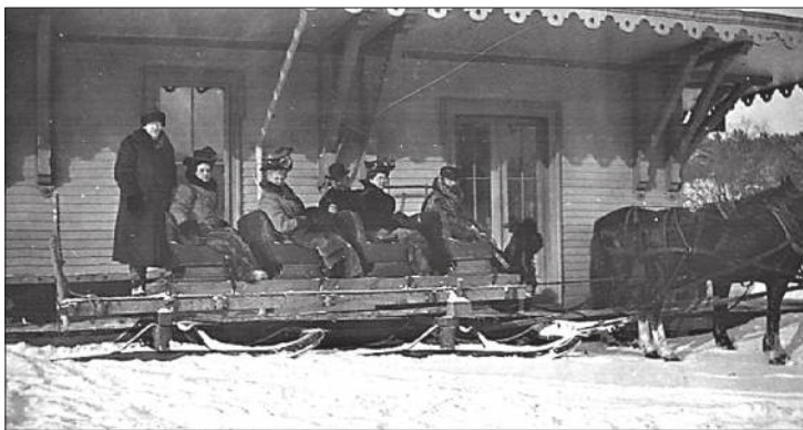
The transportation from Burleyville (East Wakefield) train station to the lake doesn't look like it would be much fun in a blizzard.