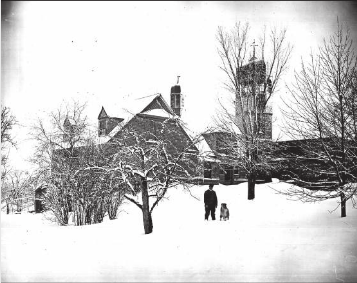
The iconic Bancroft barn, circa 1910, was a pleasure to behold in any season but was especially attractive in winter. Unfortunately it no longer stands.