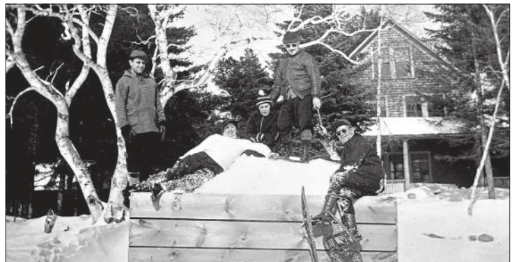
Good friends enjoying the quiet beauty of Great East Lake in winter, 1936.