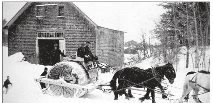
In the days before plows, horse-drawn rollers compressed the snow to help keep roads passable.